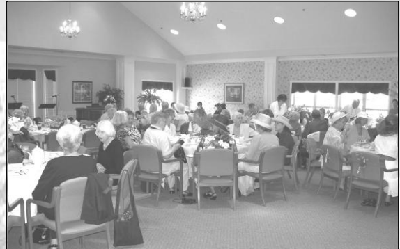
Afternoon finery enhanced an elegant tea party